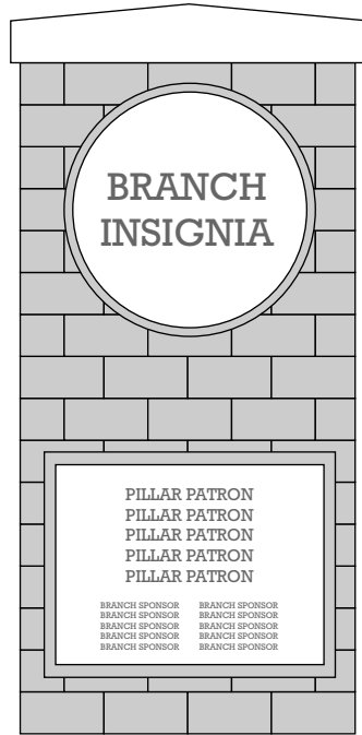
MILITARY BRANCH PILLAR FIVE PILLARS AVAILABLE