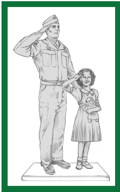
STATUE DONOR WILL BE RECOGNIZED NEAR BASE OF BRONZE STATUES

These images are good faith renderings to illustrate recognition of donors. Drawings are not to scale, and the bronze soldier will stand approximately 6'2".